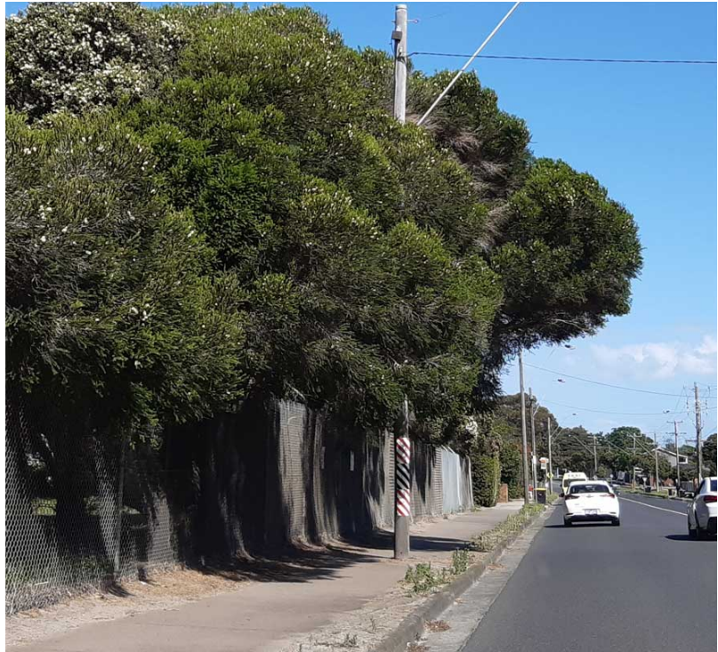
Photographed less than a week ago